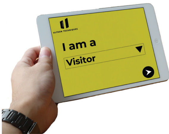
Example of the app for residential estates